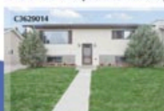
410 2 Ave NW (Black Diamond)

offered at: $289,900 2 Bds | 1 Bth | 2,019 ft 2 Total