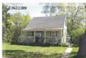
918 Rundle Crescent NE

offered at: $499,900 3 Bds | 3 Bths | 2411 ft 2