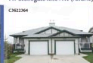
447 Stonegate Rise NW (Airdrie)

offered at: $325,000 3 Bds | 3 Bths | 1,033 ft 2 Total