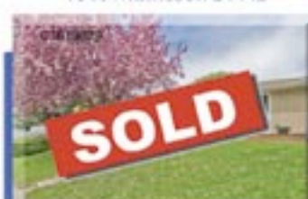
1816 Matheson Dr NE

offered at: $479,900 2 Bds | 2 Bths | 2002 ft 2 Total