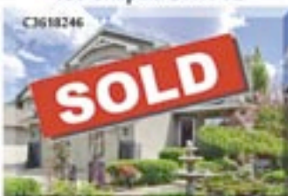
188 Chapala Drive SE

offered at: $499,900 3 Bds | 3 Bths | 2411 ft 2