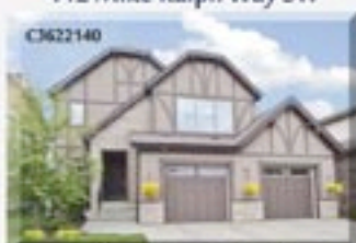
112 Mike Ralph Way SW

offered at: $924,900 5 Bds | 4.5 Bths | 3,810 ft 2 Total