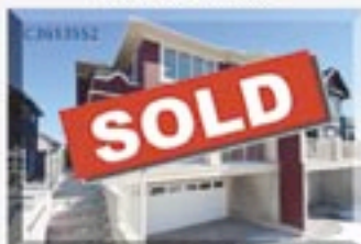
64 6A Street NE

offered at: $ 1,189,000 3 Bds | 3.5 Bths | 3622 ft 2 Total