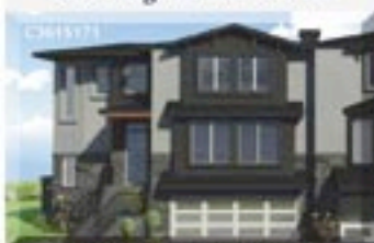
1357 Colgrove Avenue NE

offered at: $1,648,882 3 Bds | 3.5 Bths | 2494 ft 2