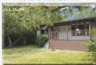
1812 13 Avenue NW

offered at: $649,900 3 Bds | 2 Bths | 2,432ft 2 Total