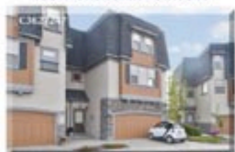
133 Wentworth Point SW

offered at: $634,900 3 Bds | 2.5 Bths | 2,495 ft 2 Total